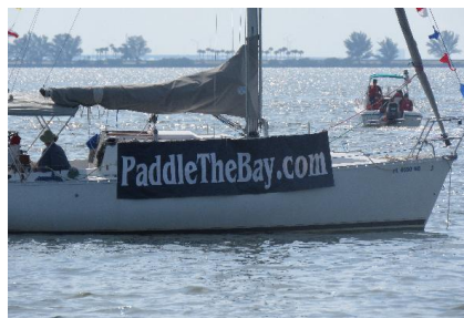
Paddle the Bay at the Finish Line