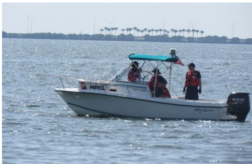
Sea Turtle (Div 1)