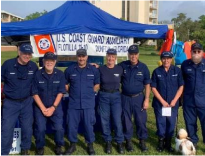
The Morning Crew

The Flotilla participated in the Paddle the Bay event at Safety Harbor. There were two races, a three mile and seven mile race along the Courtney Campbell Causeway on Upper Tampa Bay.