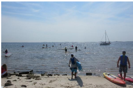
Boats Taking to the Water