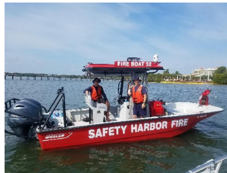
Safety Harbor Fire Boat