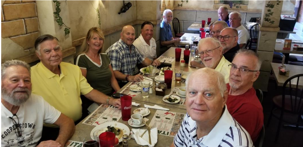
October Fellowship Luncheon

We meet on the first Friday of each month at 12:30 at Umberto's. Everyone is welcome.