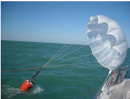
The "Can" P-6 Pump