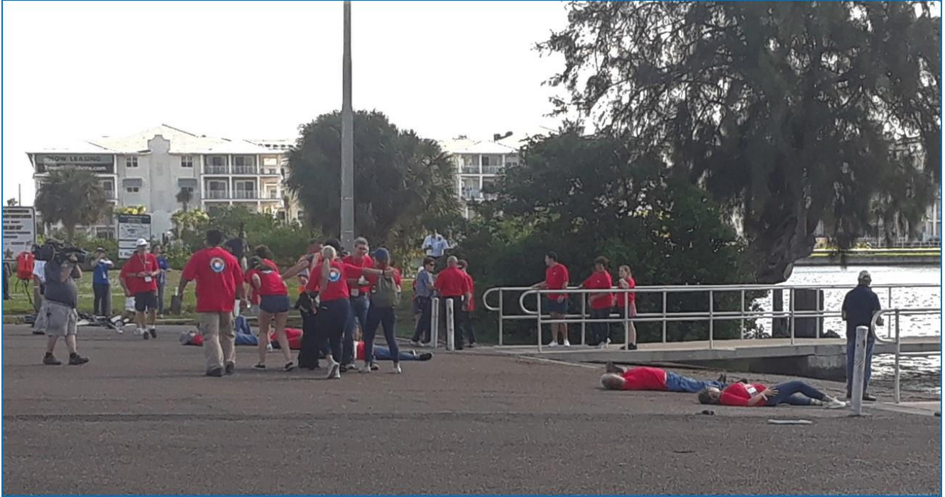
Boat Ramp Casualties