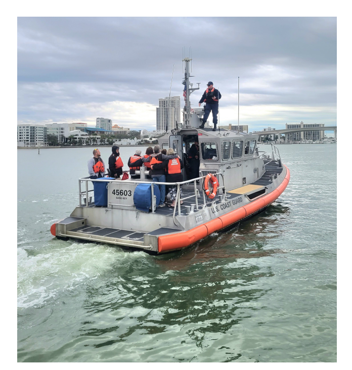
Coast Guard boat underway